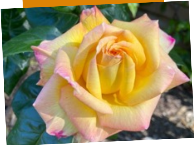
A Peace Rose in the first flourish of Spring